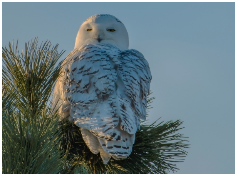
Sleepy Snowy Owl Posing for Pictures

http://assabetvalleycc.com - The club meets on the first and third Wednesdays of each month except July and Aug. Currently meetings are on Zoom and begin at 7:00 PM - Program starts at 7:30 PM. Email us at info@assabetvalleycc.com for more information or if you wish to attend as a guest.