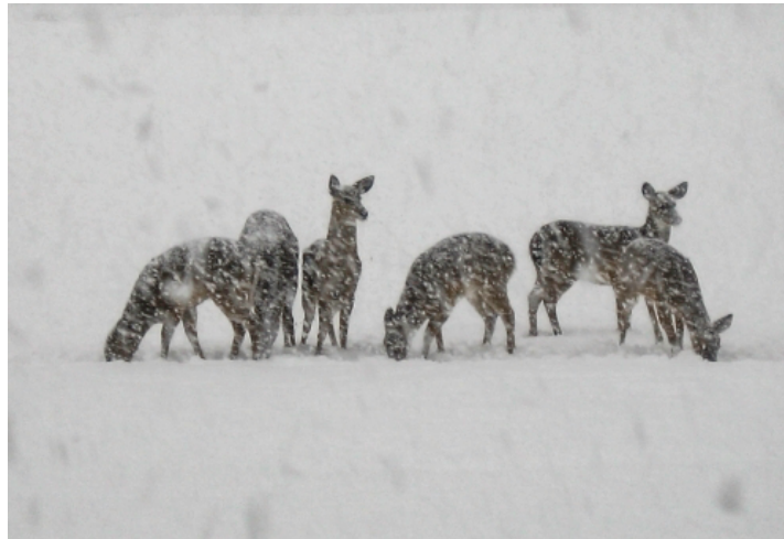
Deer in Snow - Alan Mertz