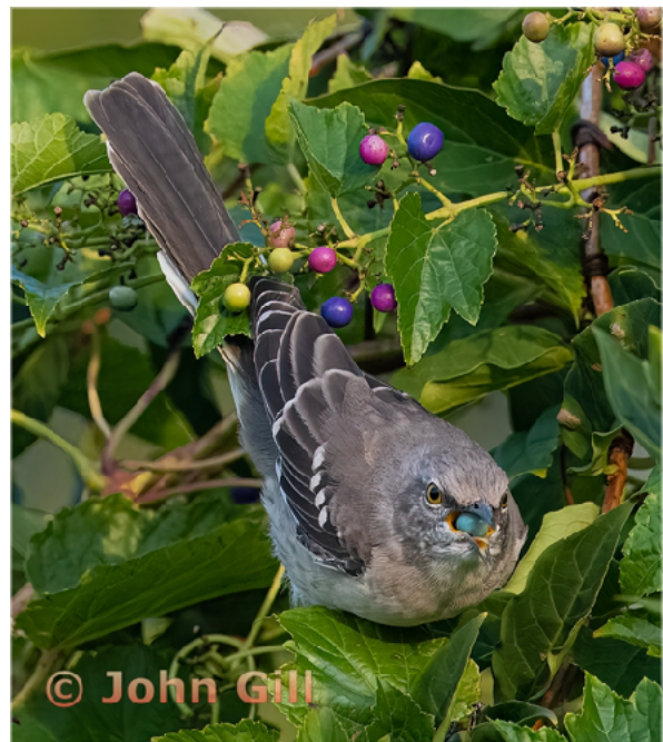
Mockingbird with Porcelain Berry 2