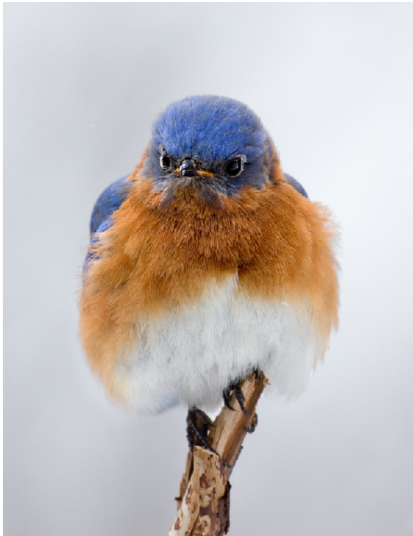
Bluebird looking at me