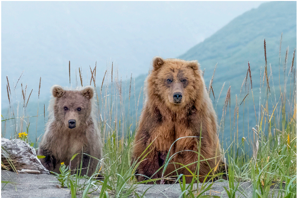
Mom and Cub Posing by Mountains - Image Courtesy of Sue Abrahamsen

Clearly Sue is an artist in many ways and an inspiration in the quality and enthusiasm of her photography.