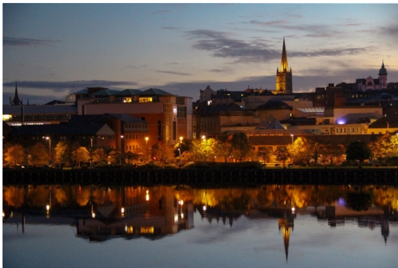
Derry City Lights - Lynn Kerner

A home without books is a body without soul. - Cicero