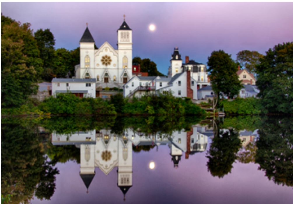
Moon over Saint Michaels