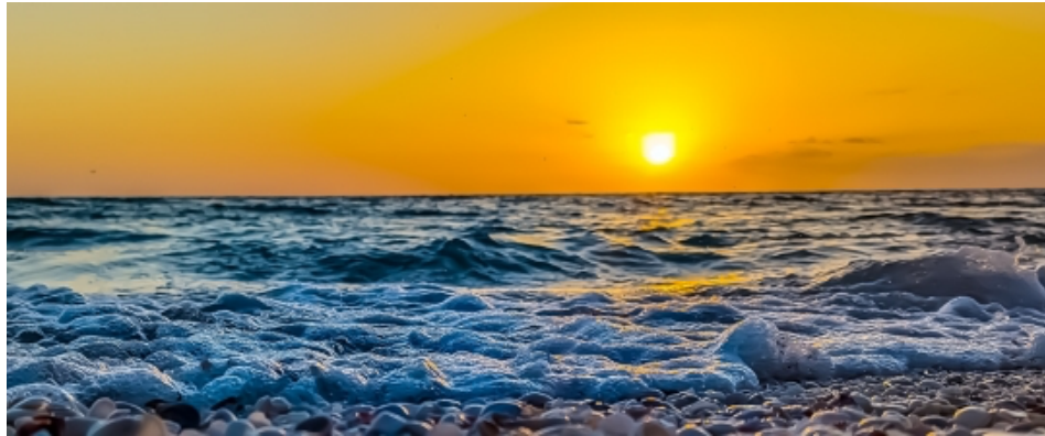
Sunset at Turner's Beach - Bridget Perch

Cafe 641, Hudson - AVCC Member show that changes monthly - December/January - group exhibit - photographs by 8 AVCC members ending 1/5/23 followed by works by Jack Casey (non AVCC)