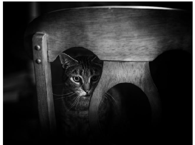
Come Sit With Me - Liz Krouse