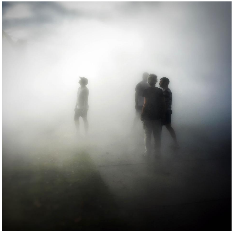
Fog on Fenway