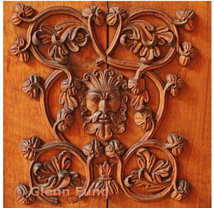
Santa Maria del Ammiraglio Door - Palermo - Glenn Fund

“The two most engaging powers of a photograph are to make new things familiar and familiar things new.” – William Thackeray