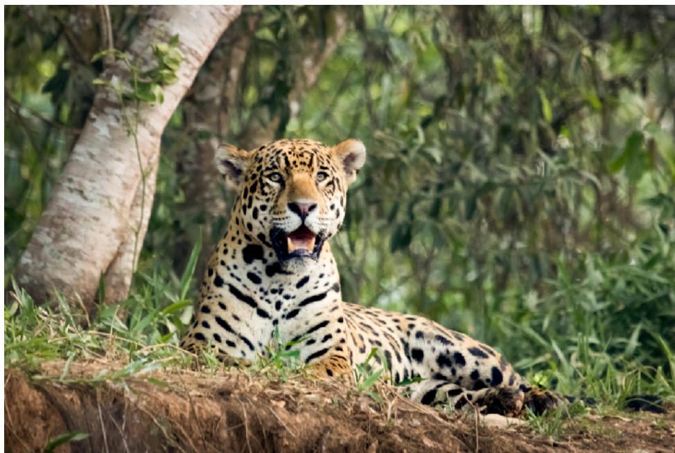
Jaguar resting under tree