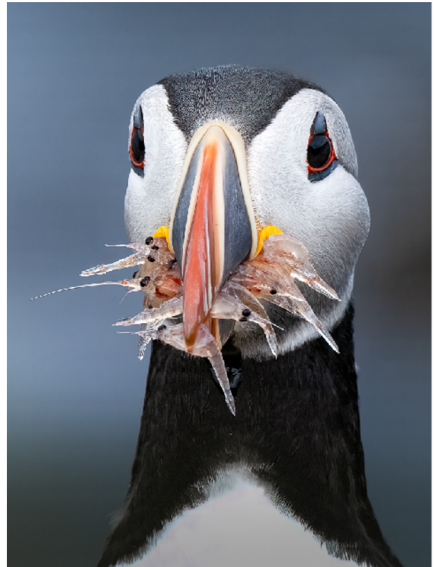
Puffin Portrait - PSA Merit Award