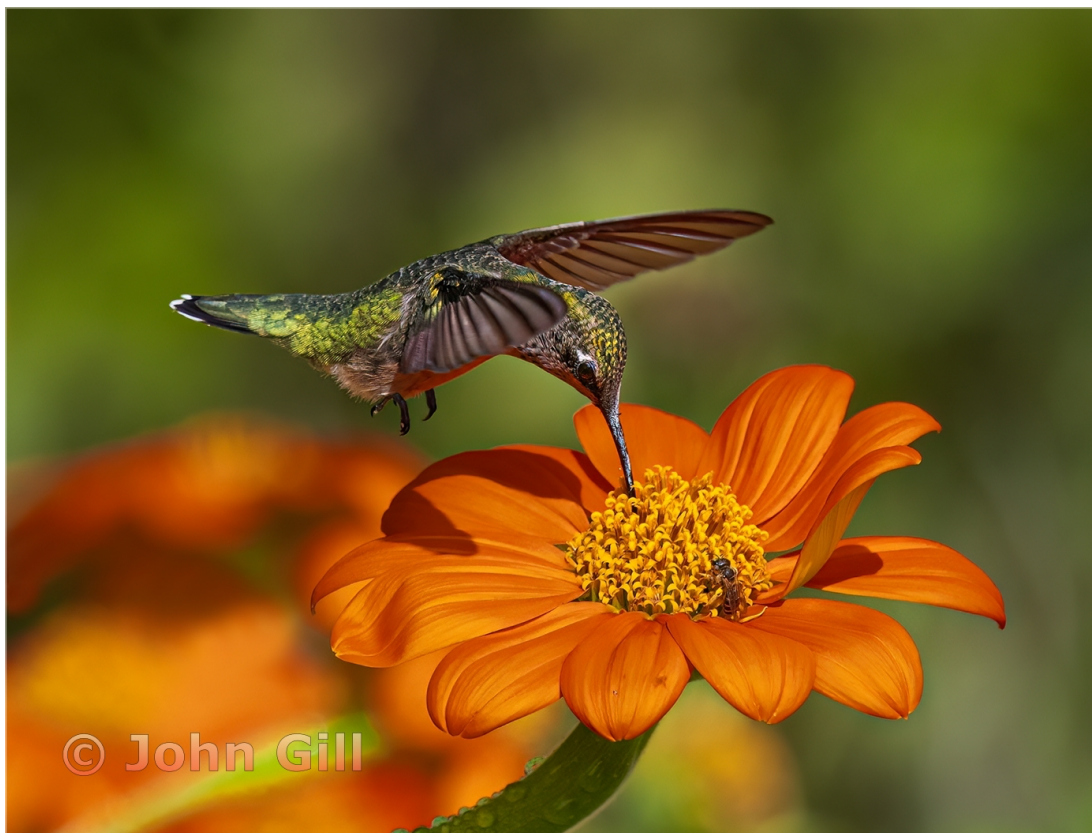
Hummingbird on Mexican Sunflower